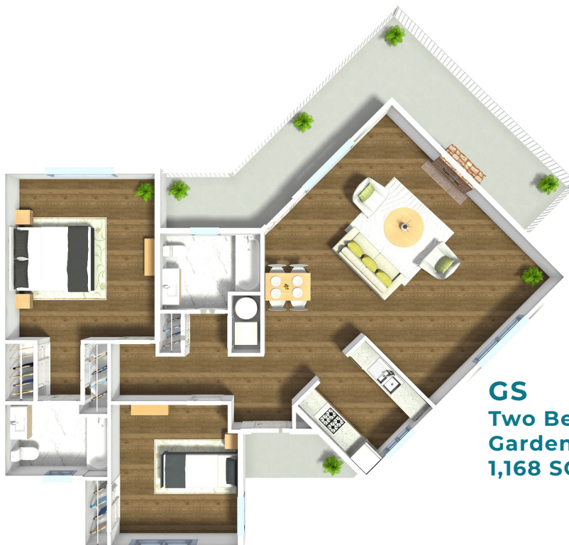
GS Two Bedroom Garden Suite 1,168 SQ FT