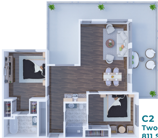
C2 Two Bedroom 811 SQ FT

Solstice Senior Living at Las Cruces 151 North Roadrunner Parkway, Las Cruces, NM 88011 (855) 910-9399 SolsticeSeniorLivingLasCruces.com