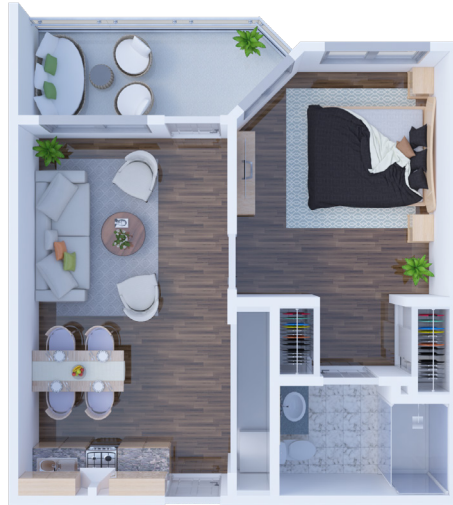
B1 One Bedroom 549 SQ FT