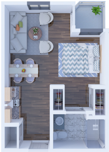
A4 Studio 396 SQ FT

Solstice Senior Living at Las Cruces offers several floor plan choices to suit your needs.