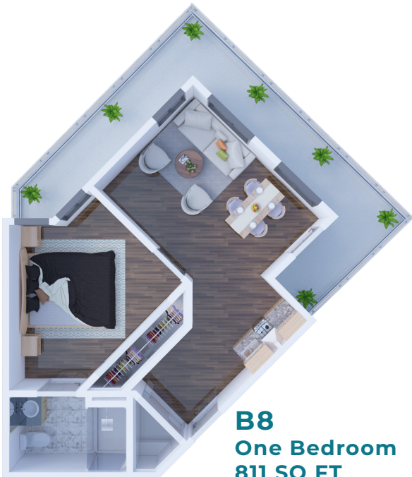
B8 One Bedroom 811 SQ FT