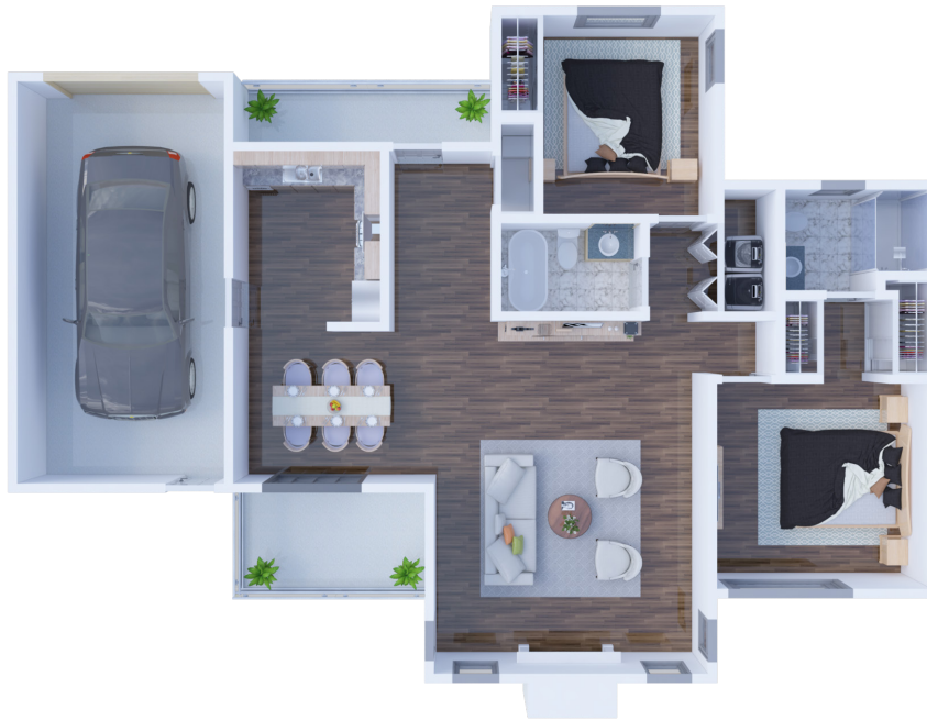
C1 Cottage 1,203 SQ FT